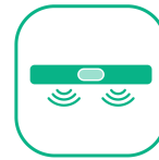
2*Speakers with Stereo Sound