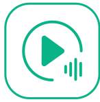
All-in-One Audio & Video Device