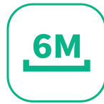
6m Pick-up Range